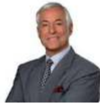
Brian Tracy, President, Brian Tracy International

"This practical, fast-moving book shows you how to continually increase your value, your income and your career opportunities throughout your life."