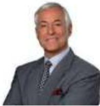
Brian Tracy, President, Brian Tracy International

"This practical, fast-moving book shows you how to continually increase your value, your income and your career opportunities throughout your life."